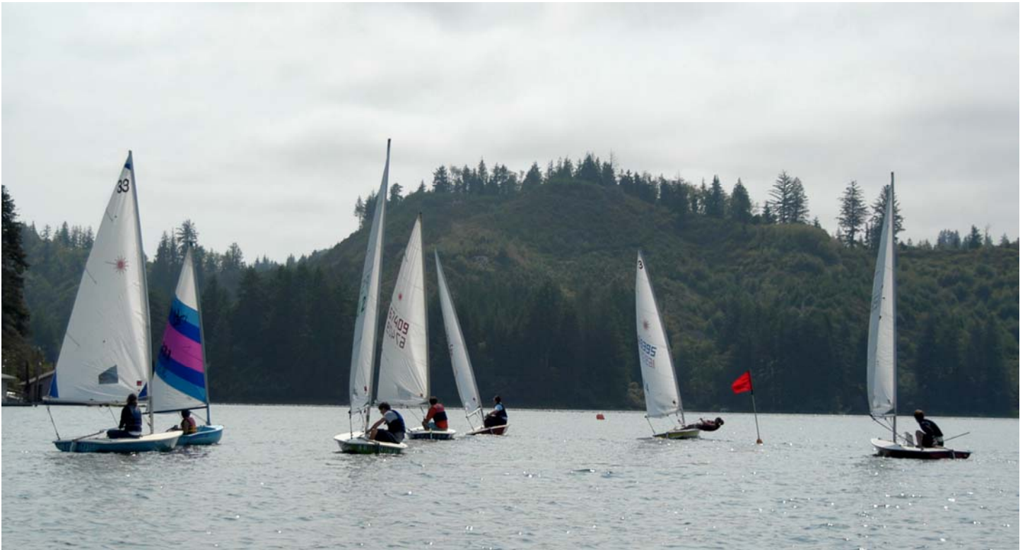
Junior Sailors at Labor Day Regatta