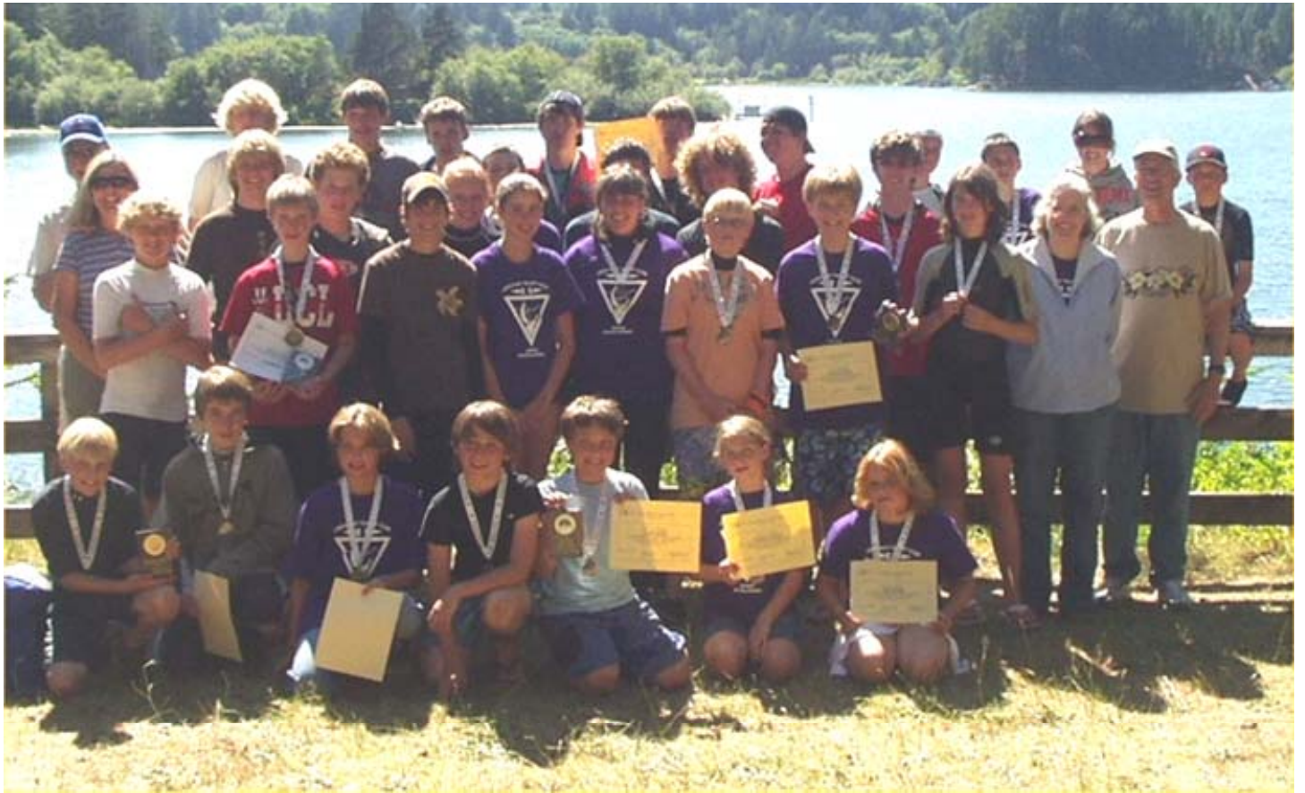
2007 Junior Sailing School