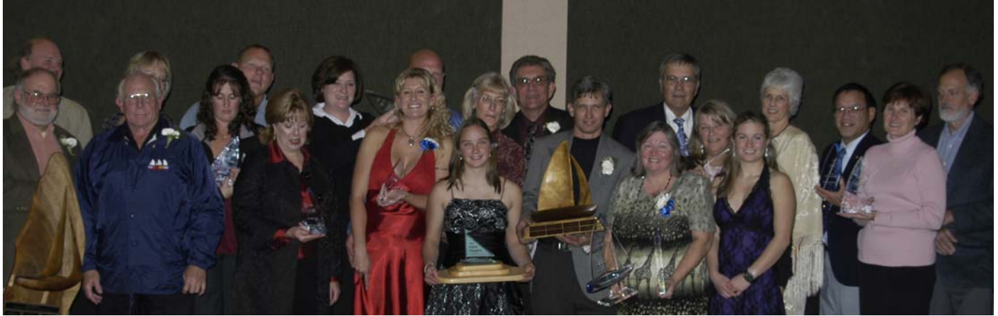
2007 Racing Trophy Winners