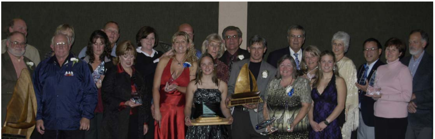
2007 Racing Trophy Winners