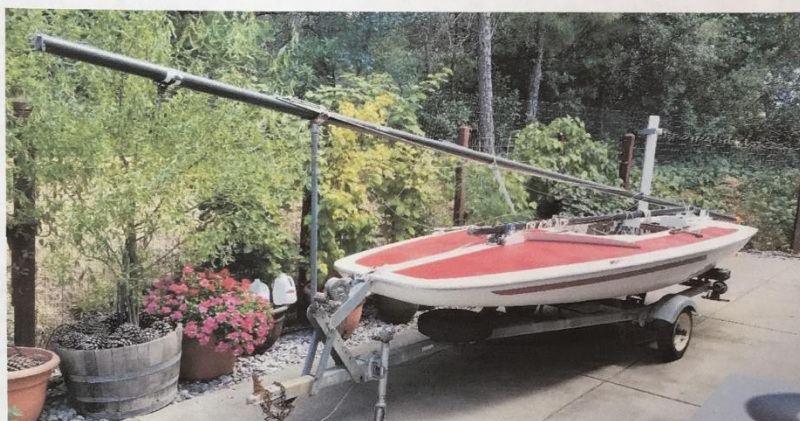
1979 Melges MC Scow #522